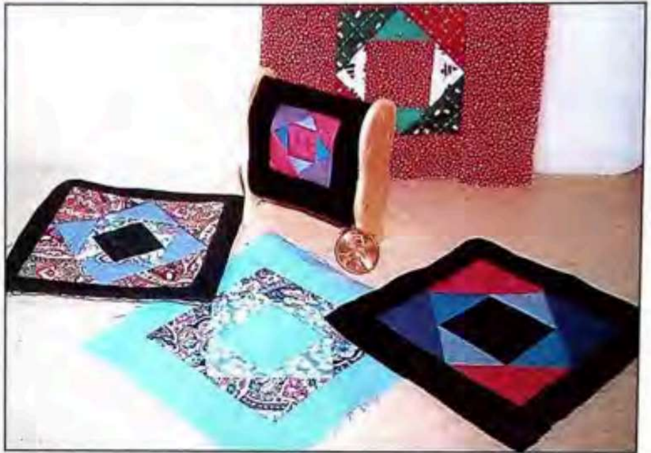
Assorted quilts made with large square in a square pattern. Quilt on rack made with smaller long pattern.

Use a sheet of Kleenex for batting. Add backing, seam edges. Tie as in an old fashioned quilt.