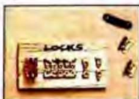
Locks, Hinges and Handle