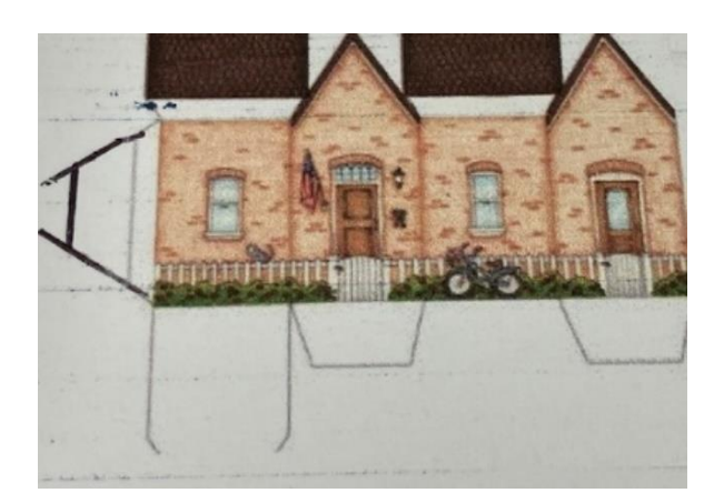
Cut out outside lines: