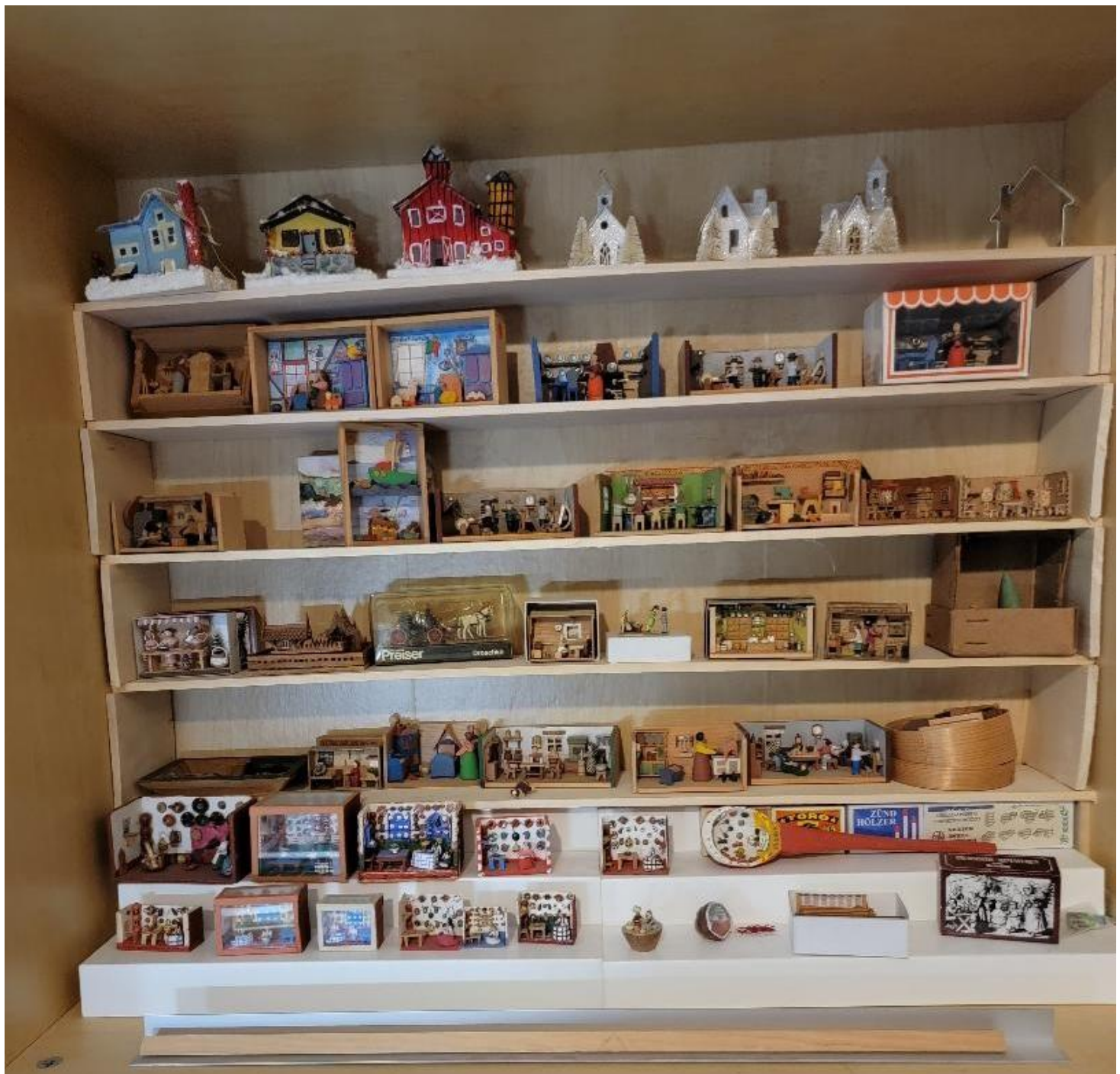
Purchased items from Germany and Mexico.