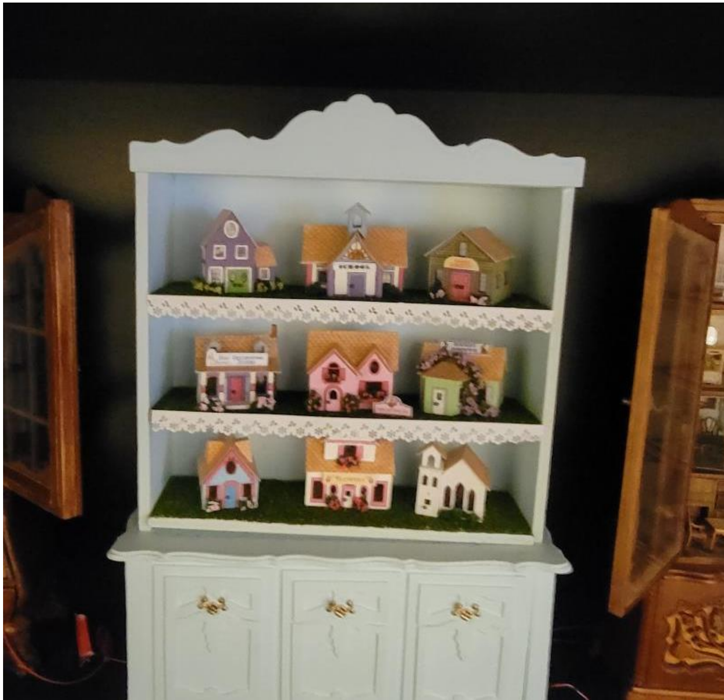
Shelf with tiny houses kit from Cynthia Howe.