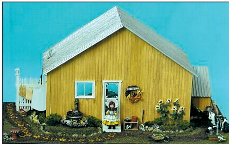
Instructions for the Sunflower Sue House were in the January/February issue.