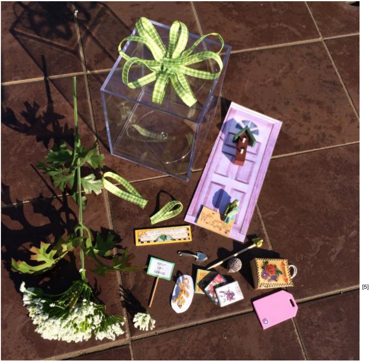
Top of the Box (bigger section)

From all your treasures, pick out about 10 items that you want to display on the top of your box. I like a bow on top of my display. You can purchase a bow or make your own. I like making my own bows because I have control of the size, shape and number of loops. I use a hot glue gun to attach everything to the top of the box because it?s more durable and attaches quickly. Try not to get the hot glue strings on the sides of your box. If you get glue strings on the sides of your box, Goo Be Gone will get rid of them. Please use whatever glue you are comfortable with. For this bow, I made 8 loops (about 2 feet of ribbon total) that reach from the middle of the top of the box to just about the end of the top of the box. Space the loops together before I glued them to the box. Tuck and glue a couple of leaves under the loops. Without gluing, lay out your items on top of the bow. When you?ve got a layout you like, glue the items on. If you?ve got empty spots to fill, add additional loops or from the floral spray,