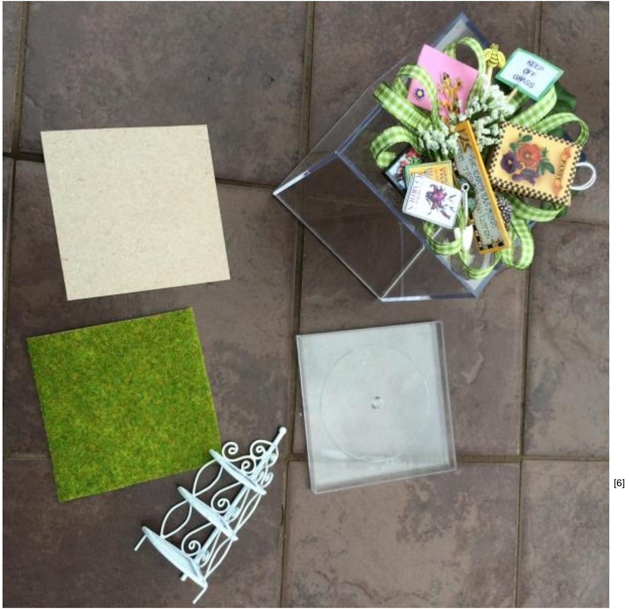
Bottom of the Box (smaller section)

Note: As you can see in the 6<sup>th</sup> photo, the bottoms and tops are different. In the garden box, the top is the taller piece. In the Christmas box, the top is the smaller piece. It?s up to you but I feel using the small piece for the top is sturdier and stays together better.