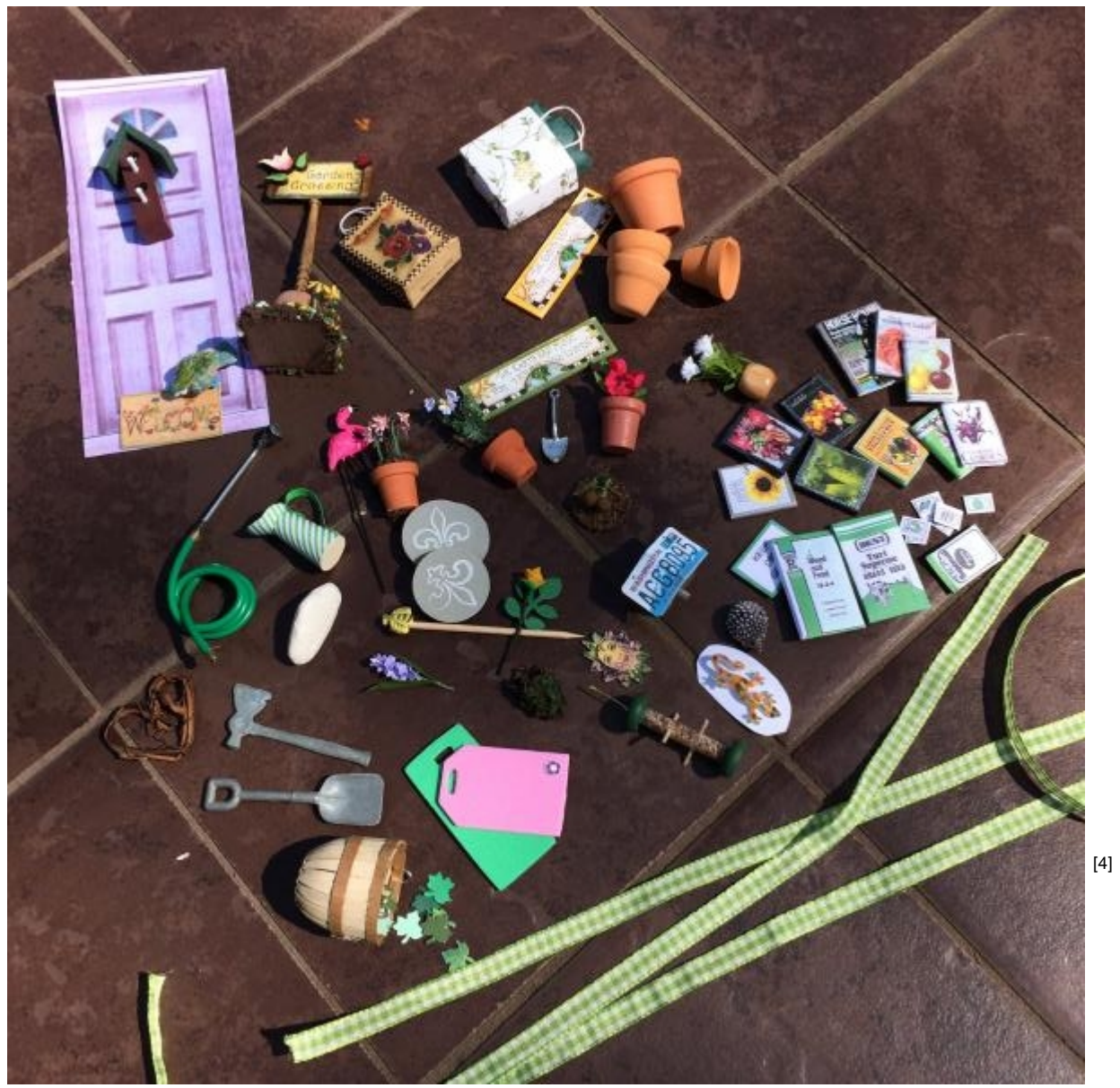
I picked out a variety of items to choose from.